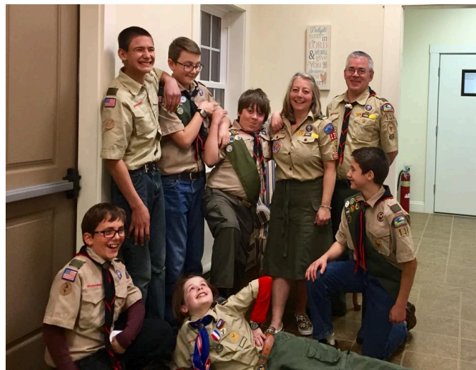
Troop 136 Court of Honor

advancements from Scout all the way to Life Scout. The Boys have been working very hard on their advancements and merit badges and we have three Scouts now preparing themselves for the next step which is Eagle Scout.